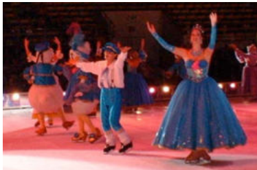
Show in Bukit Jalil, K.L. Disney On Ice: “Beauty & the Beast”