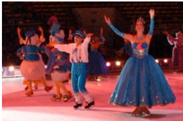
Show in Bukit Jalil, K.L. Disney On Ice: “Beauty & the Beast”